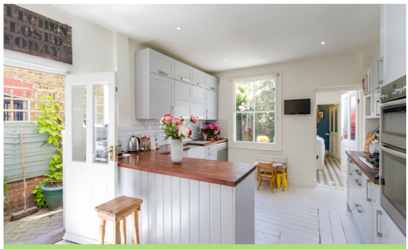
ST ELMO ROAD W12 • ASKEW ROAD AREA £695 PW / £3011 PCM