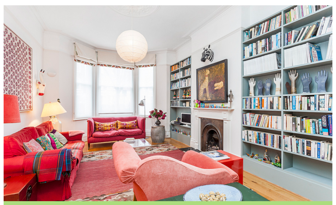
BOSCOMBE ROAD W12 • SHEPHERD'S BUSH £595 PW / £2578 PCM