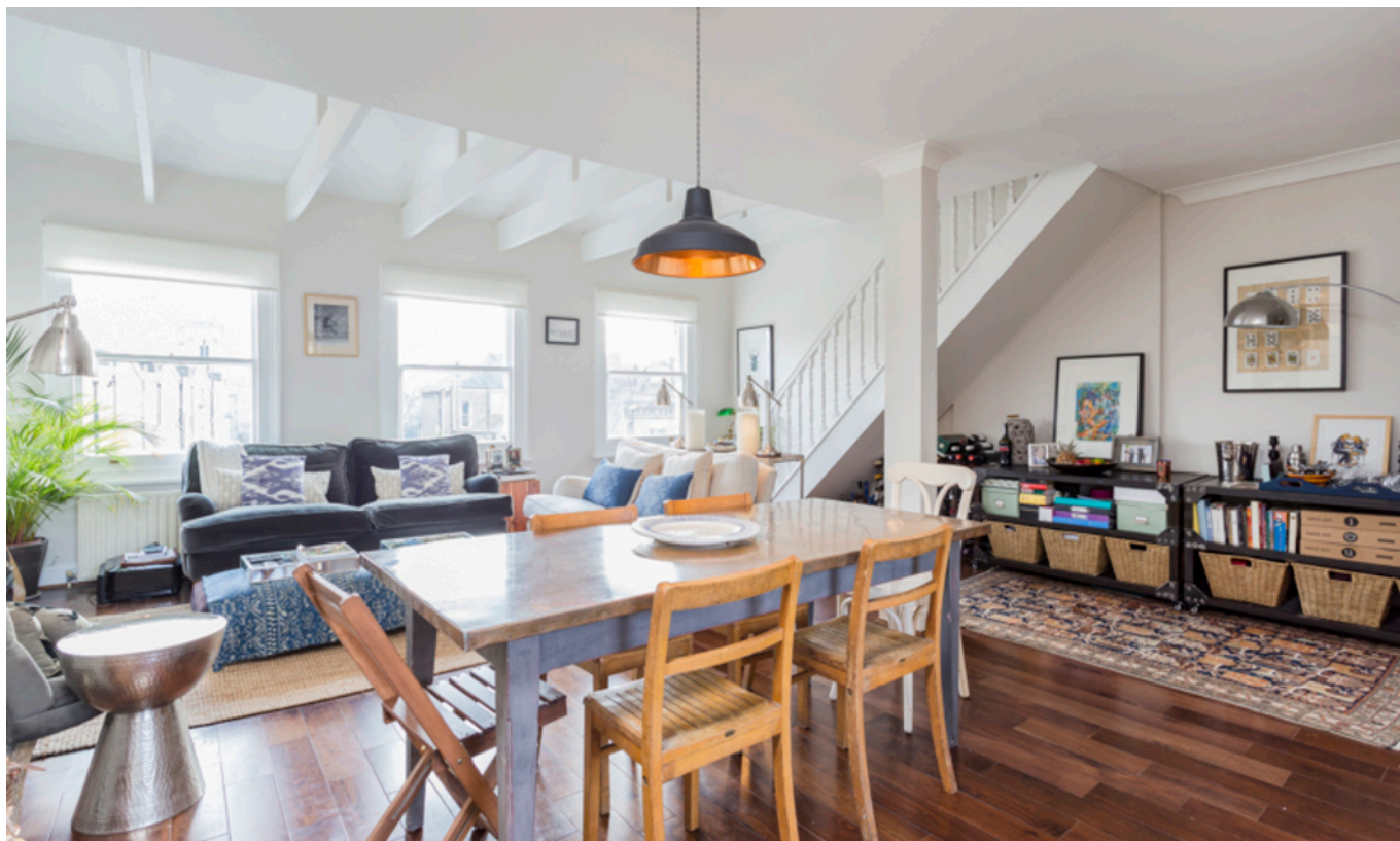
WARBECK ROAD W12 • SHEPHERD'S BUSH £835,000 SHARE OF FREEHOLD