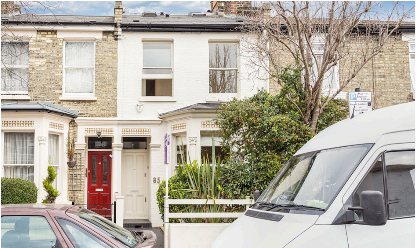
CARTHEW ROAD W6 • BRACKENBURY VILLAGE £795 PW / £3445 PCM