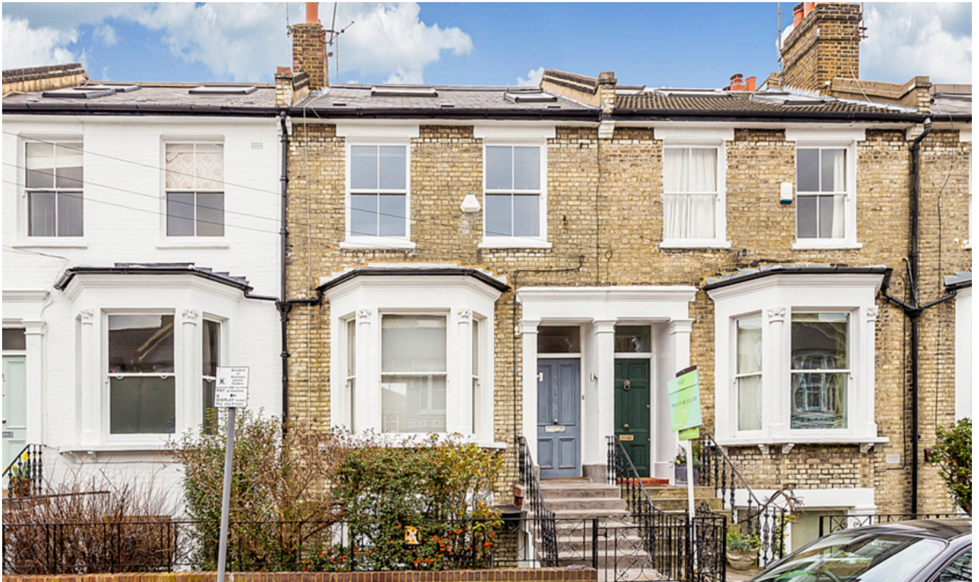
CARTHEW VILLAS W6 • BRACKENBURY VILLAGE £1000 PW / £4333 PCM