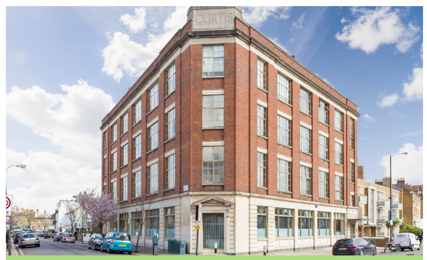
CURTIS BUILDING, PADDENSWICK ROAD W6 • BRACKENBURY VILLAGE £625 PW / £2708 PCM