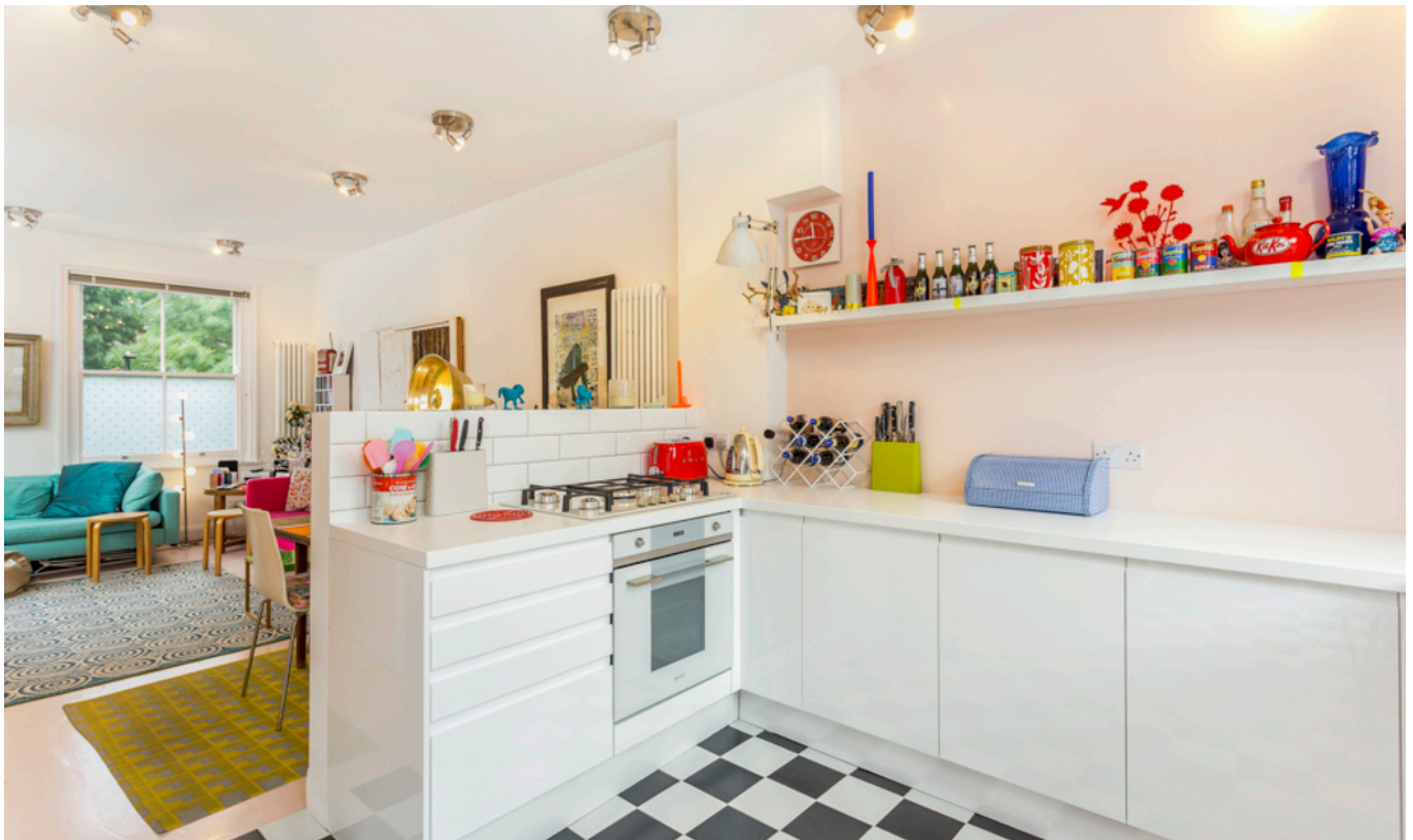
THE VALE W3 • EAST ACTON £595,000 LEASEHOLD