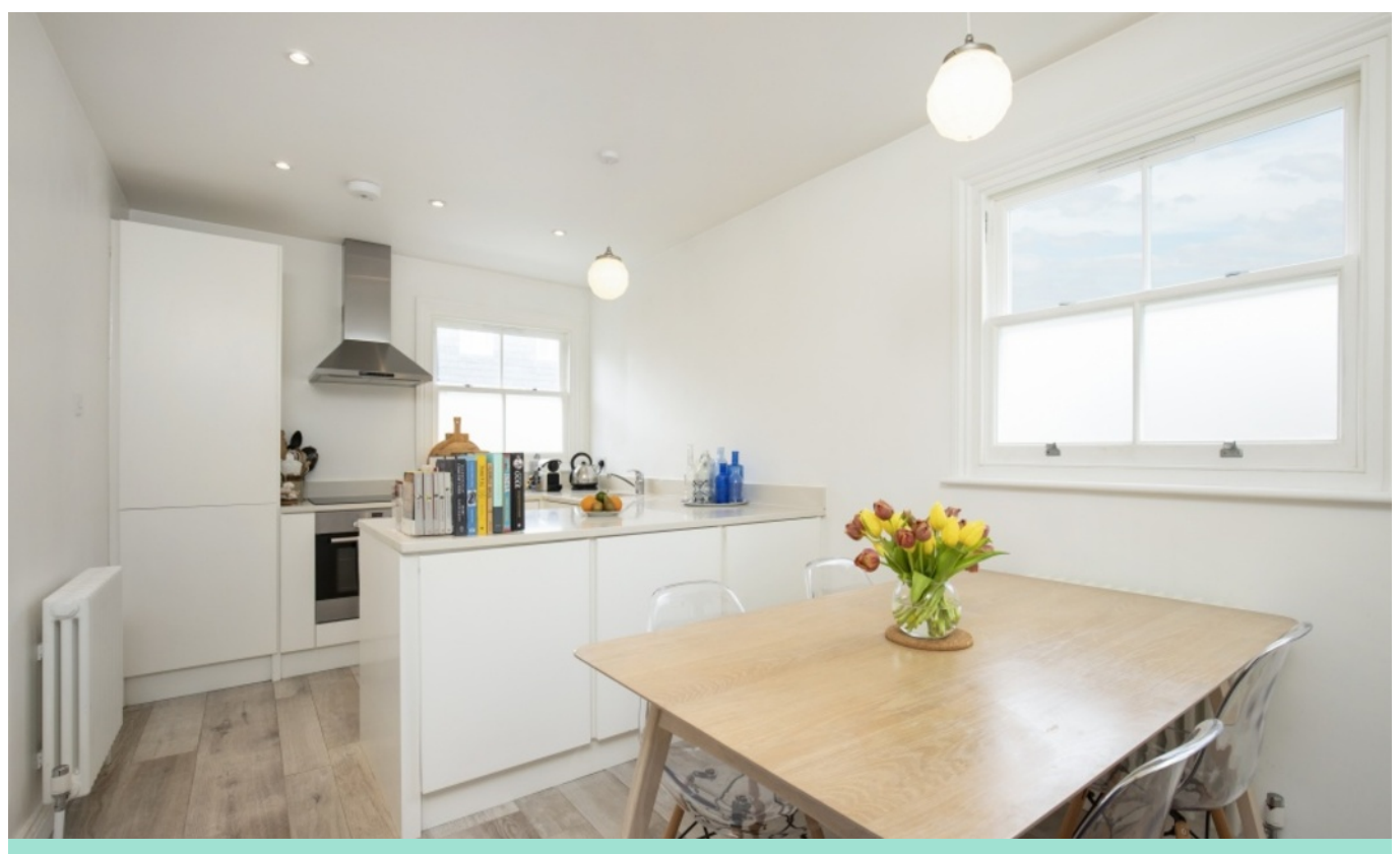
COBBOLD ROAD W12 • ASKEW ROAD AREA £675,000 SHARE OF FREEHOLD