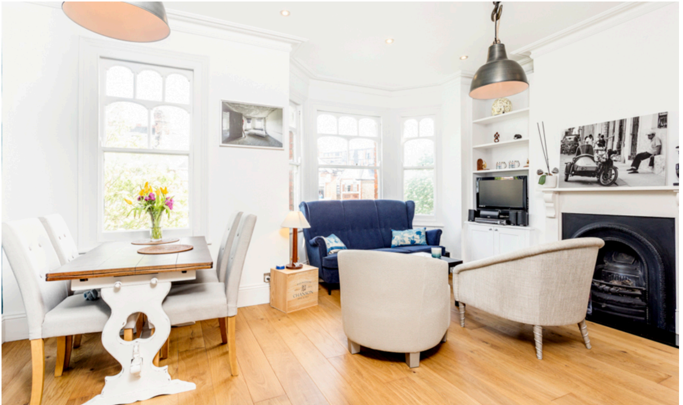
VALETTA ROAD W3 • WENDELL PARK £475 PW / £2058 PCM