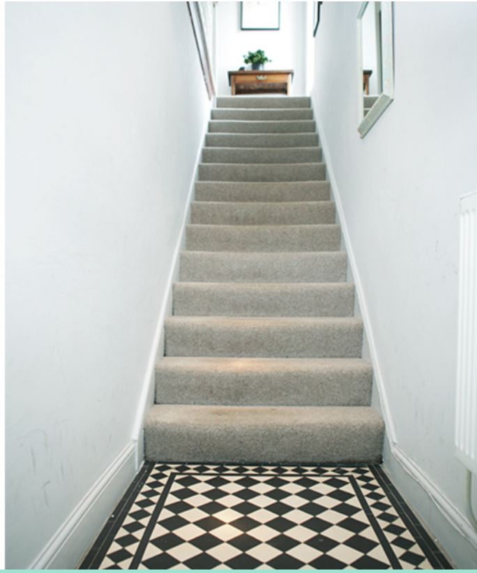
ST ELMO ROAD W12 • ASKEW ROAD AREA £645,000 LEASEHOLD