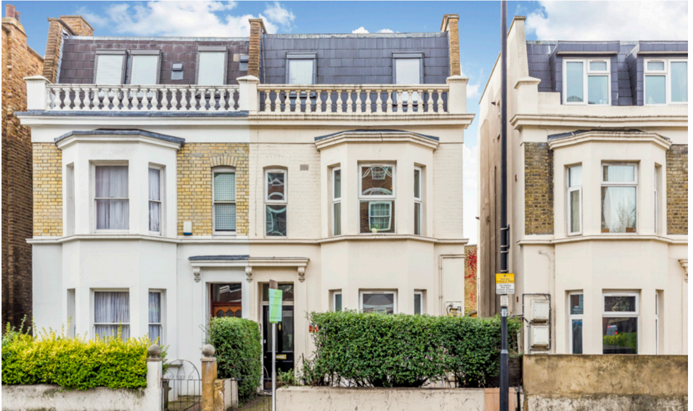
ASKEW ROAD, LONDON • ASKEW ROAD AREA £395 PW / £1711 PCM