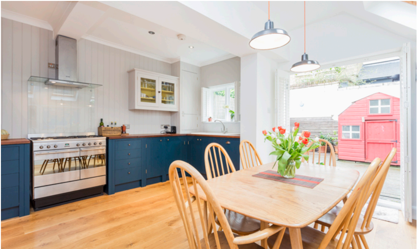
WESTVILLE ROAD W12 • ASKEW ROAD AREA £595 PW / £2578 PCM FREEHOLD