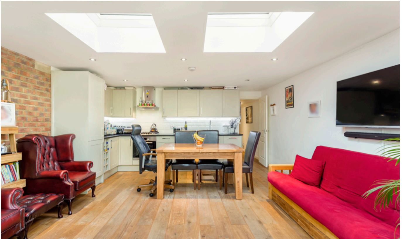
ST ELMO ROAD W12 • ASKEW ROAD AREA £450 PW / £1,950 PCM