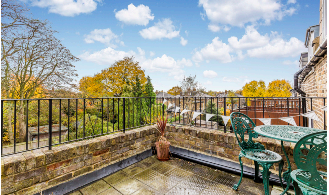
BASSEIN PARK ROAD W12 • ASKEW ROAD AREA £325 PW / £1408 PCM