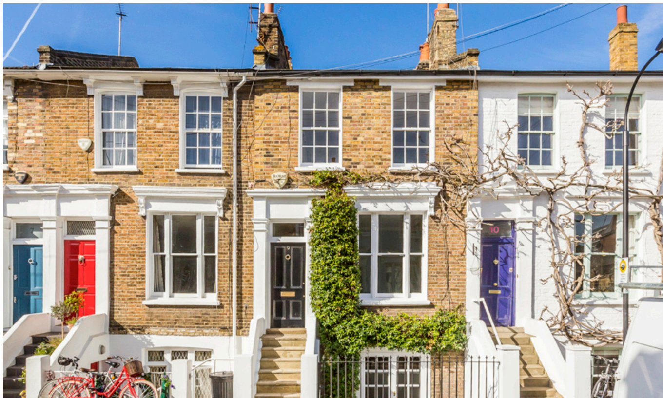
CHANCELLORS STREET W6 • RIVERSIDE £575 PW / 2491 PCM