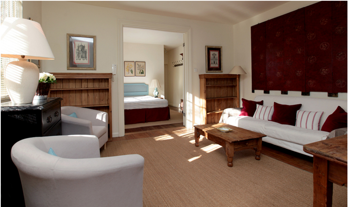
GOLDHAWK ROAD W12 • SHEPHERD'S BUSH £315 PW / £1365 PCM