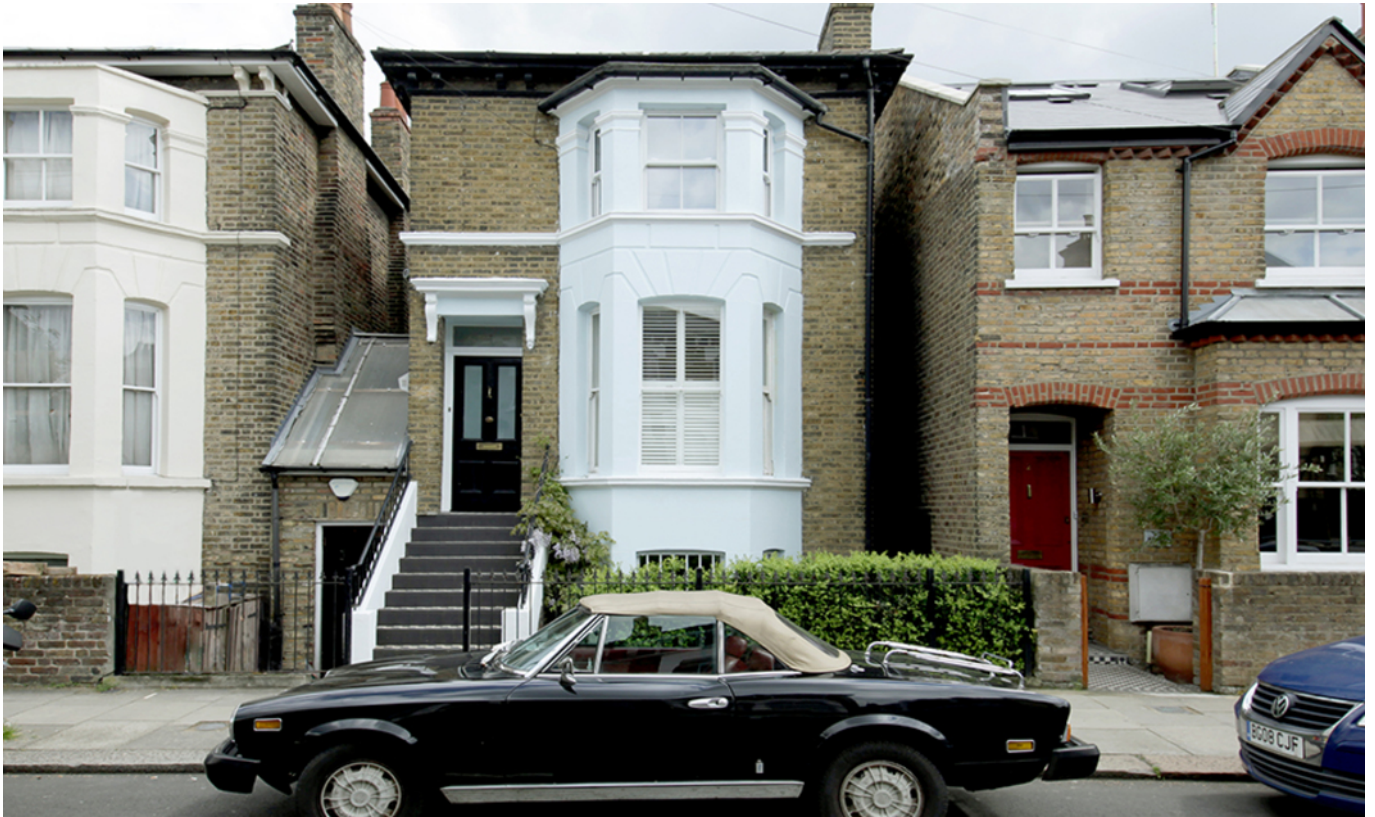
STARFIELD ROAD W12 • ASKEW ROAD AREA £1,275,000 FREEHOLD