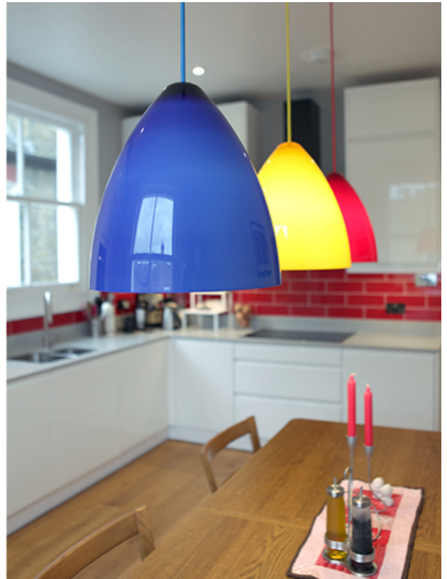
DAVIS ROAD W3 • ASKEW ROAD AREA £720,000 SHARE OF FREEHOLD