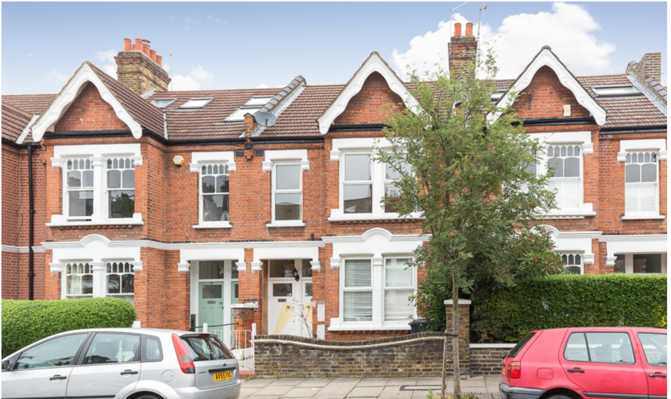
JEDDO ROAD W12 • WENDELL PARK £375 PW / £1625 PCM