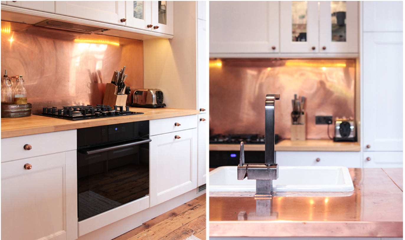
JEDDO ROAD W12 • WENDELL PARK £635,000 LEASEHOLD