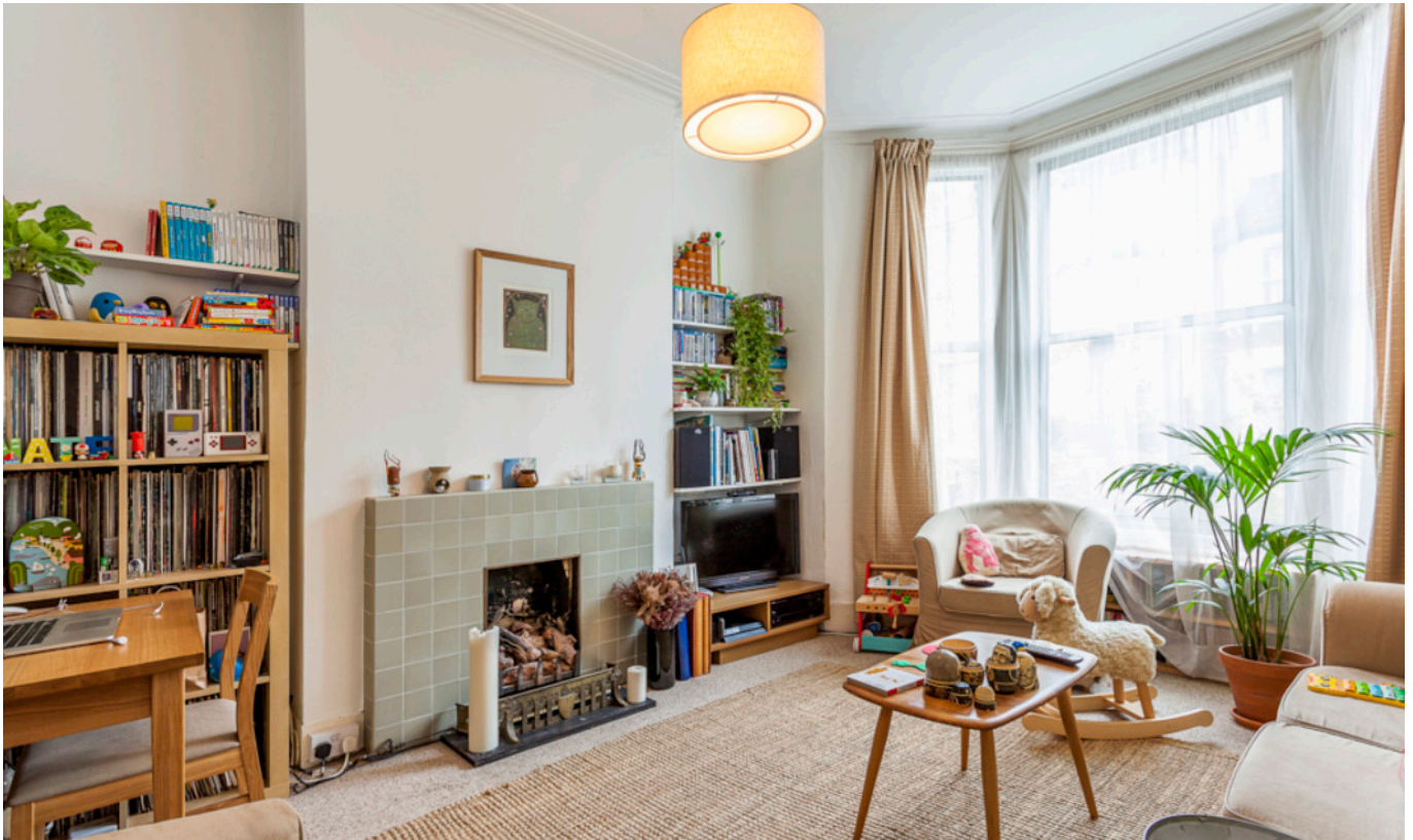
DAVISVILLE ROAD, LONDON • ASKEW ROAD AREA £300 PW / £1300 PCM