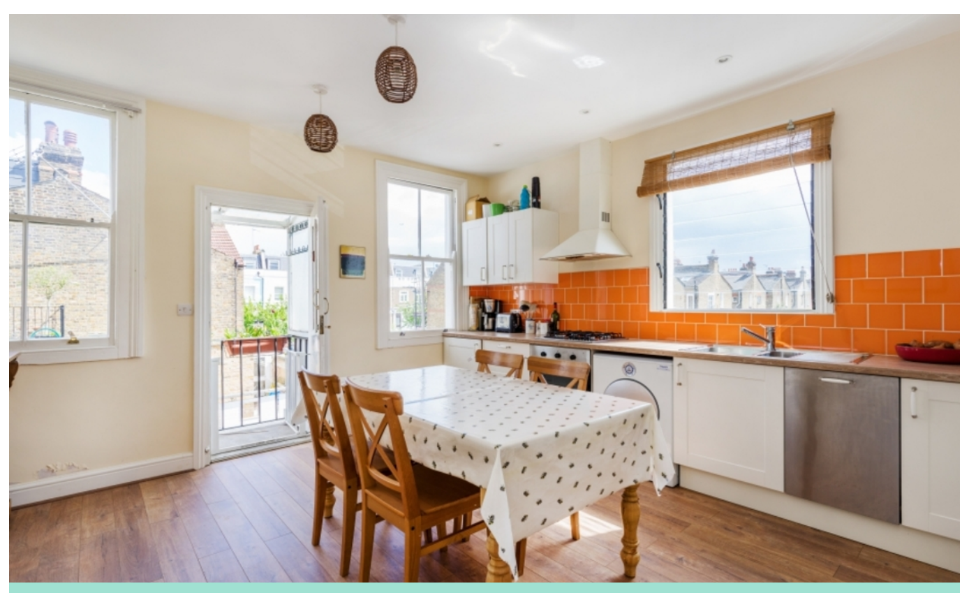
DAVIS ROAD W3 • ASKEW ROAD AREA £695,000 SHARE OF FREEHOLD