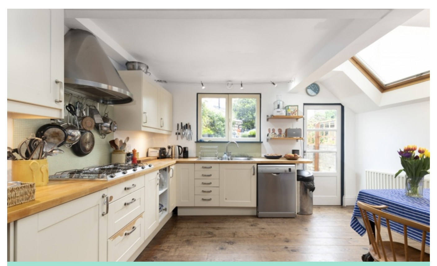
BECKLOW ROAD W12 • WENDELL PARK £1,100,000 FREEHOLD