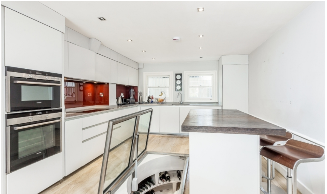
GOLDHAWK ROAD W12 • SHEPHERD'S BUSH £900 PW / £3900 PCM