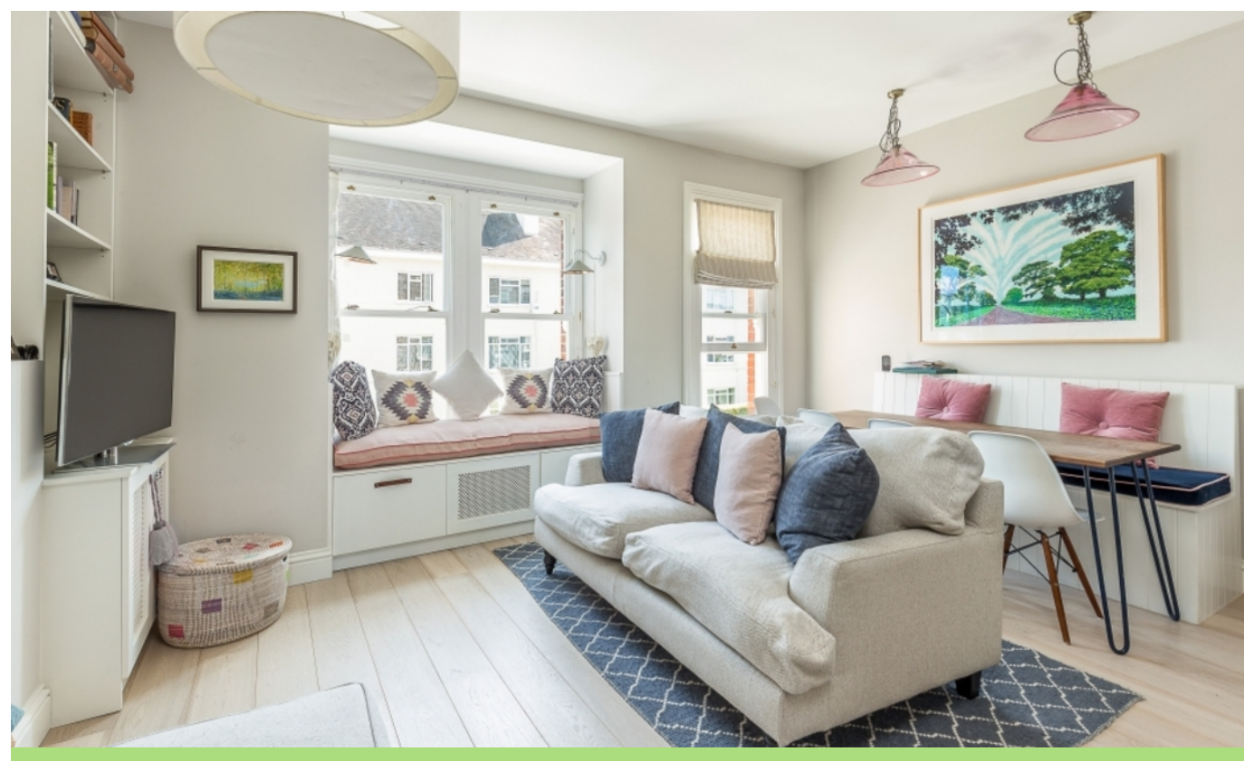
PERCY ROAD W12 • ASKEW ROAD AREA £495 PW / £2145 PCM SHARE OF FREEHOLD