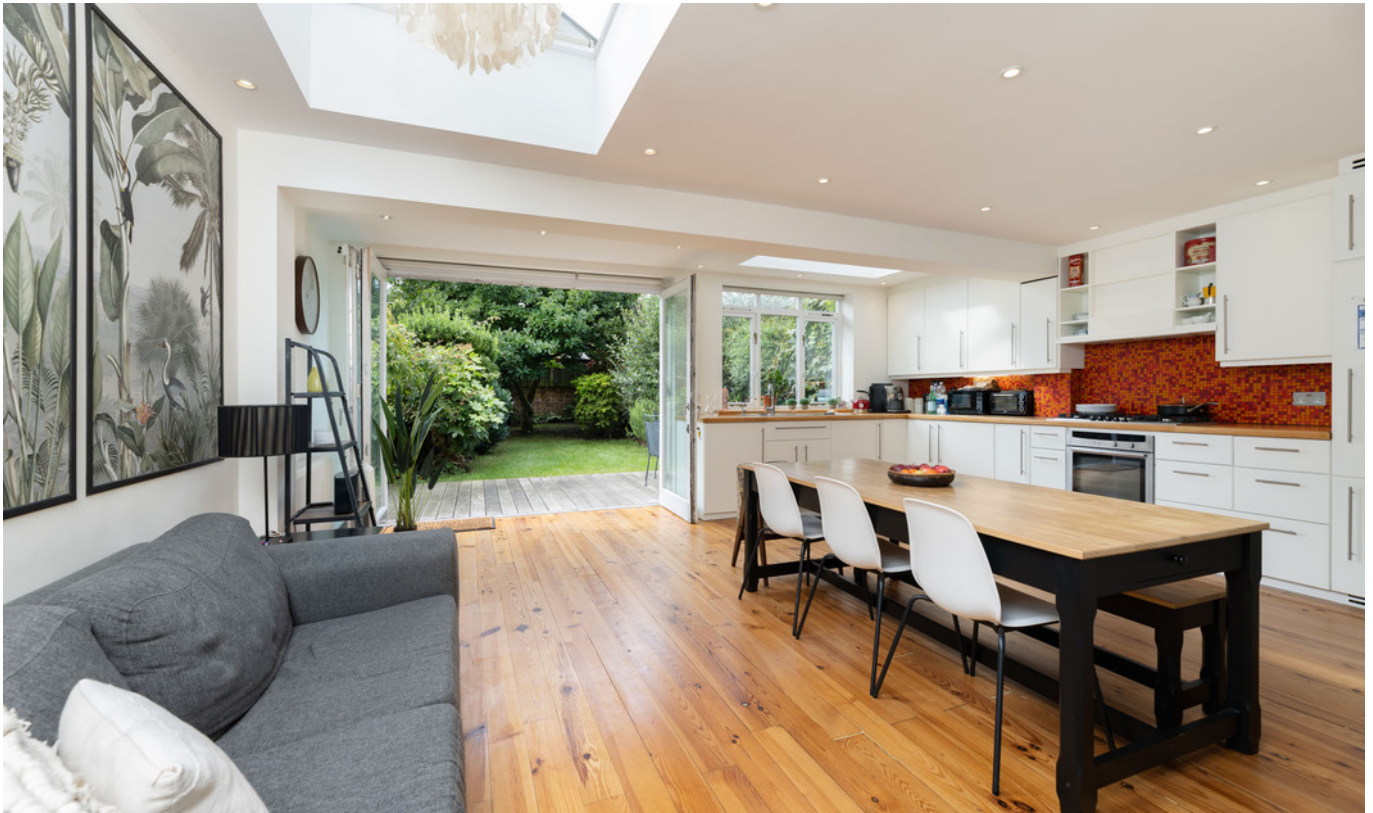
ASHCHURCH GROVE W12 • ASHCHURCH AREA £1200 PW / £5200 PCM