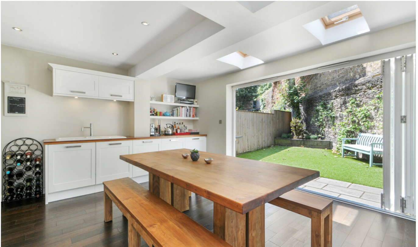
DORVILLE CRESCENT W6 • BRACKENBURY VILLAGE £750 PW / £3250 PCM