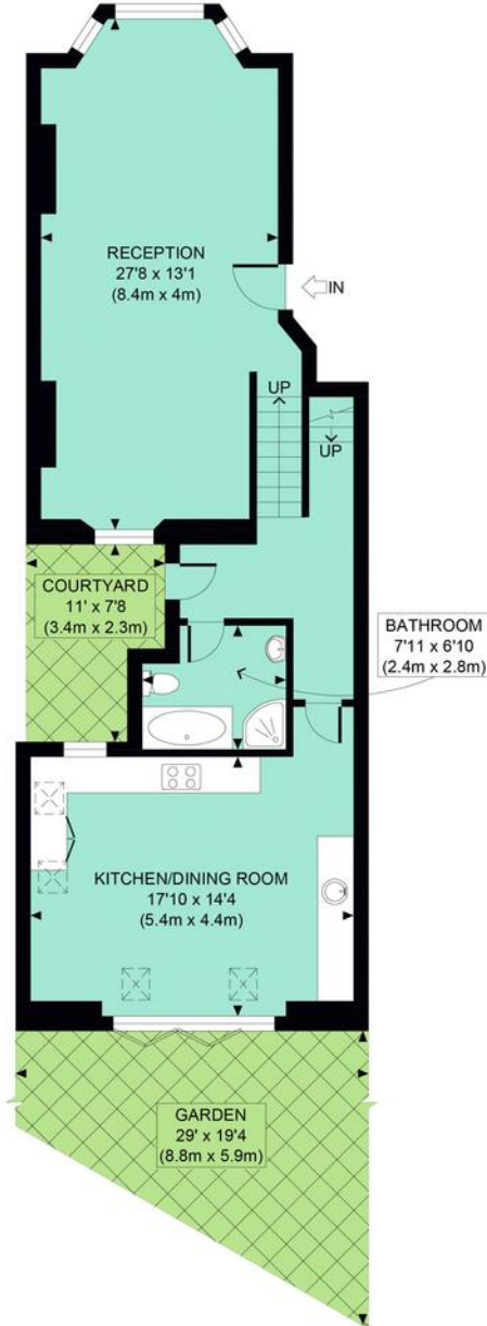
RAISED GROUND FLOOR GROSS INTERNAL FLOOR AREA 768 SQ FT

APPROX. GROSS INTERNAL FLOOR AREA 1174 SQ FT / 109 SQM