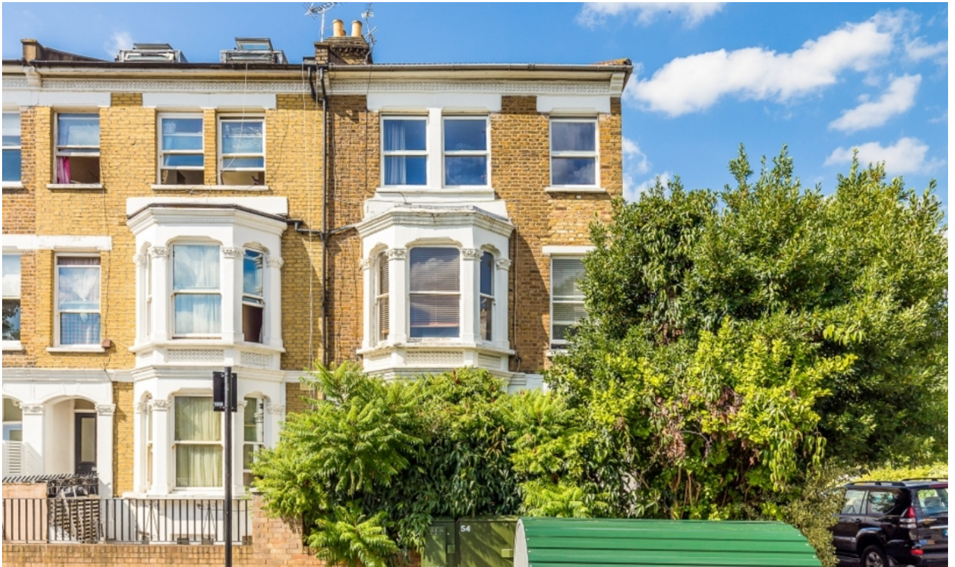
BASSEIN PARK ROAD W12 • ASKEW ROAD AREA £550,000 SHARE OF FREEHOLD