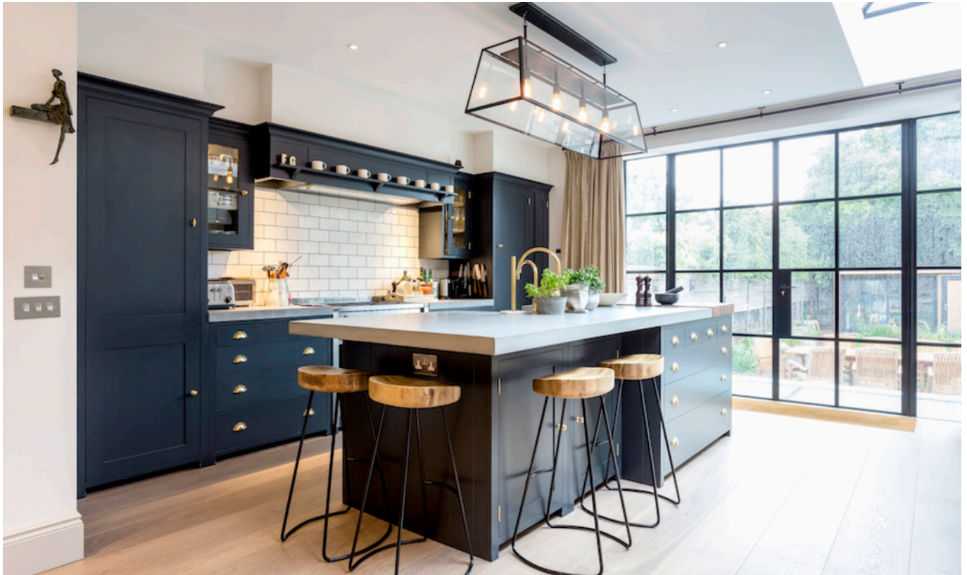
BASSEIN PARK ROAD W12 • WENDELL PARK GUIDE PRICE £2,500,000 FREEHOLD