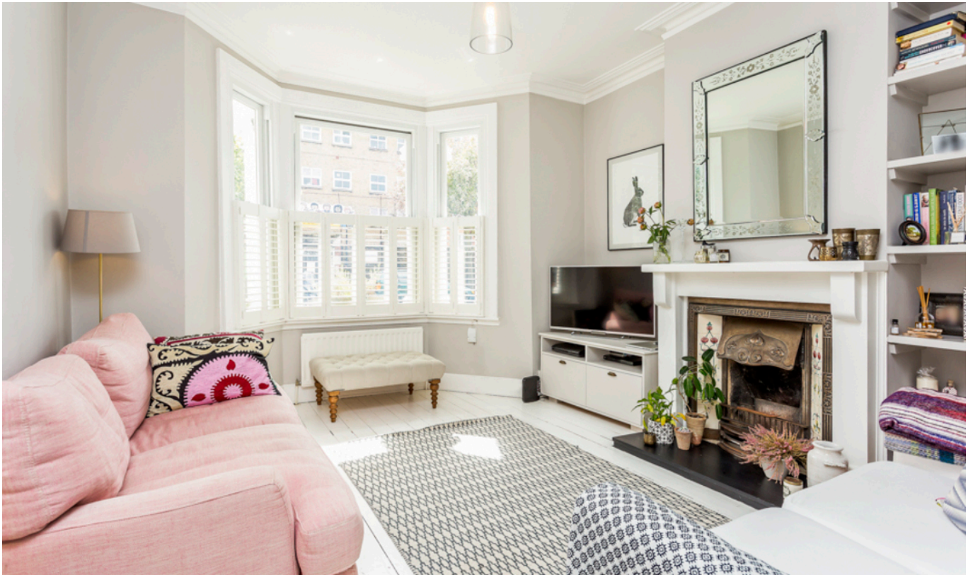
KINNEAR ROAD W12 • WENDELL PARK £495 PW / £2145 PCM