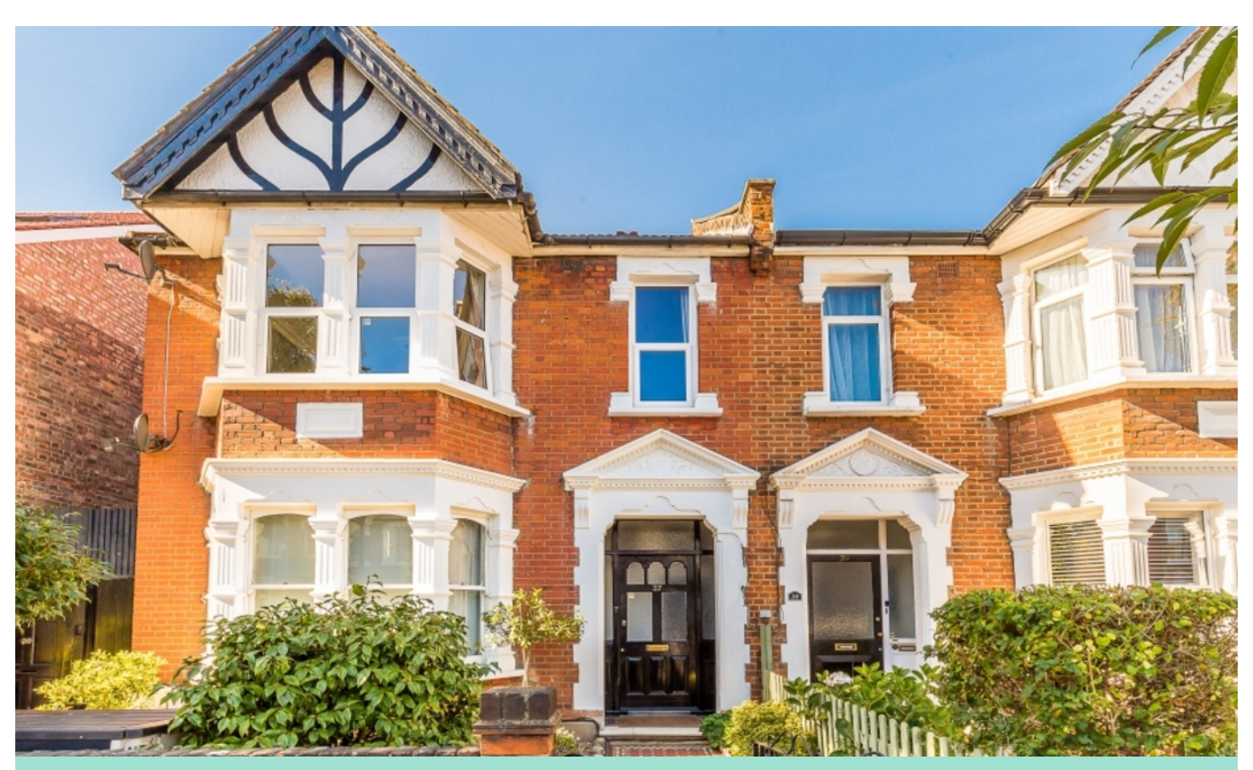
FIRST AVENUE W3 • ASKEW ROAD AREA £625,000 SHARE OF FREEHOLD