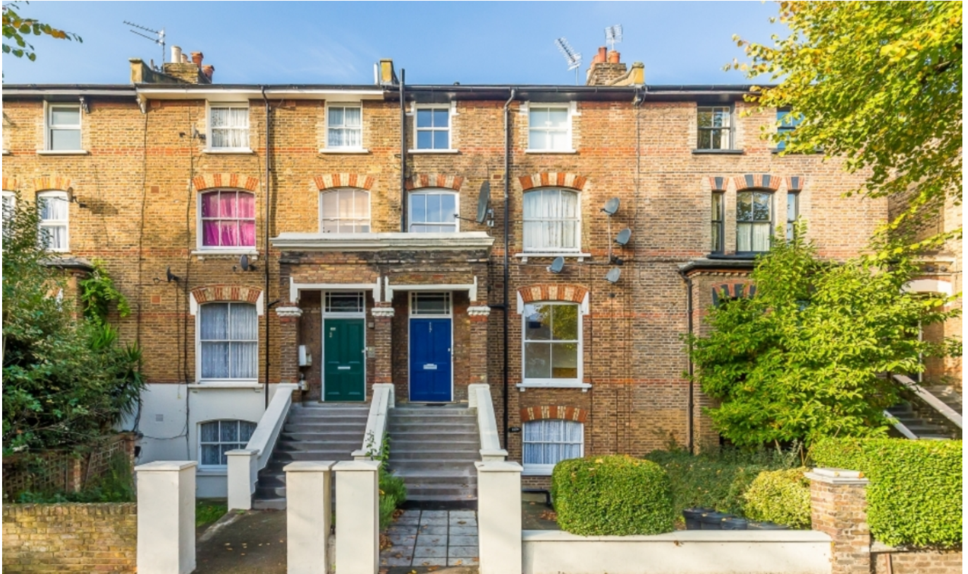
CONINGHAM ROAD W12 • SHEPHERD'S BUSH £320 PW / £1386 PCM