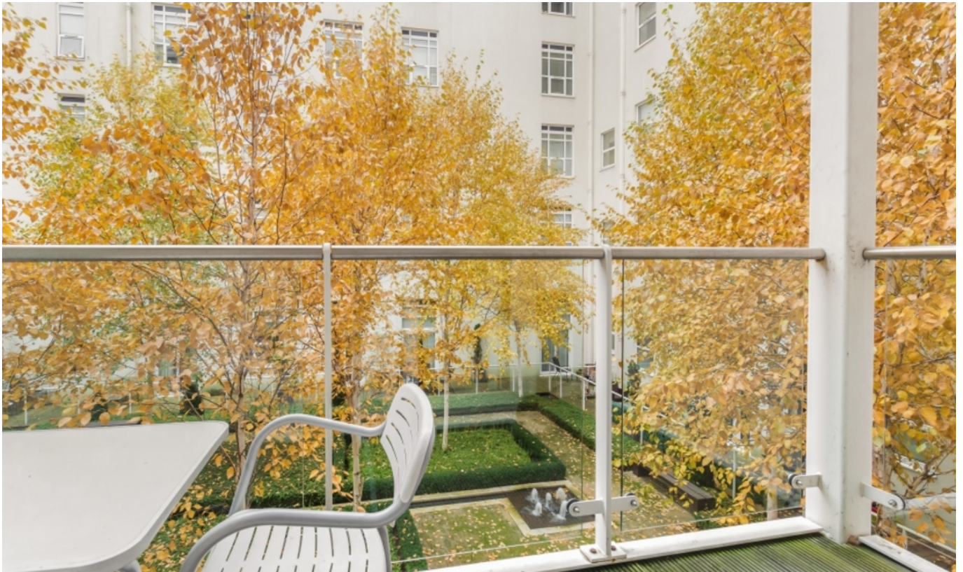
BROMYARD HOUSE W3 • EAST ACTON £410 PW / £1776 PCM