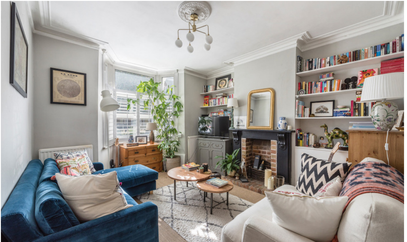
BECKLOW ROAD W12 • ASKEW ROAD AREA £449,950 LEASEHOLD