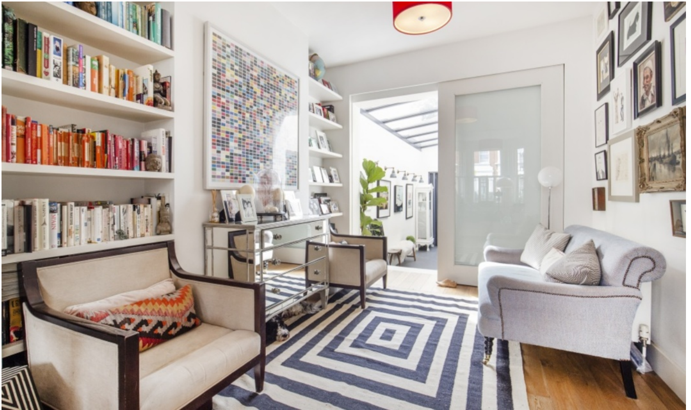
ROXWELL ROAD W12 • ASKEW ROAD AREA £850 PW / £3,683 PCM