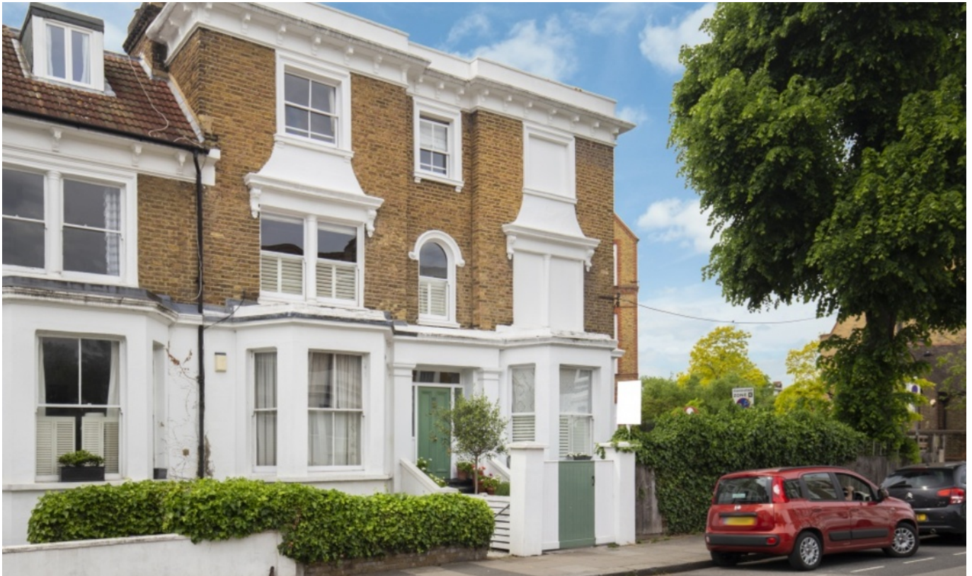
BRACKENBURY ROAD W6 • BRACKENBURY VILLAGE £1,150,000 LEASEHOLD