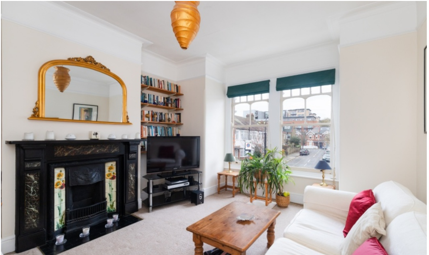
JEDDO ROAD W12 • WENDELL PARK £650,000 LEASEHOLD