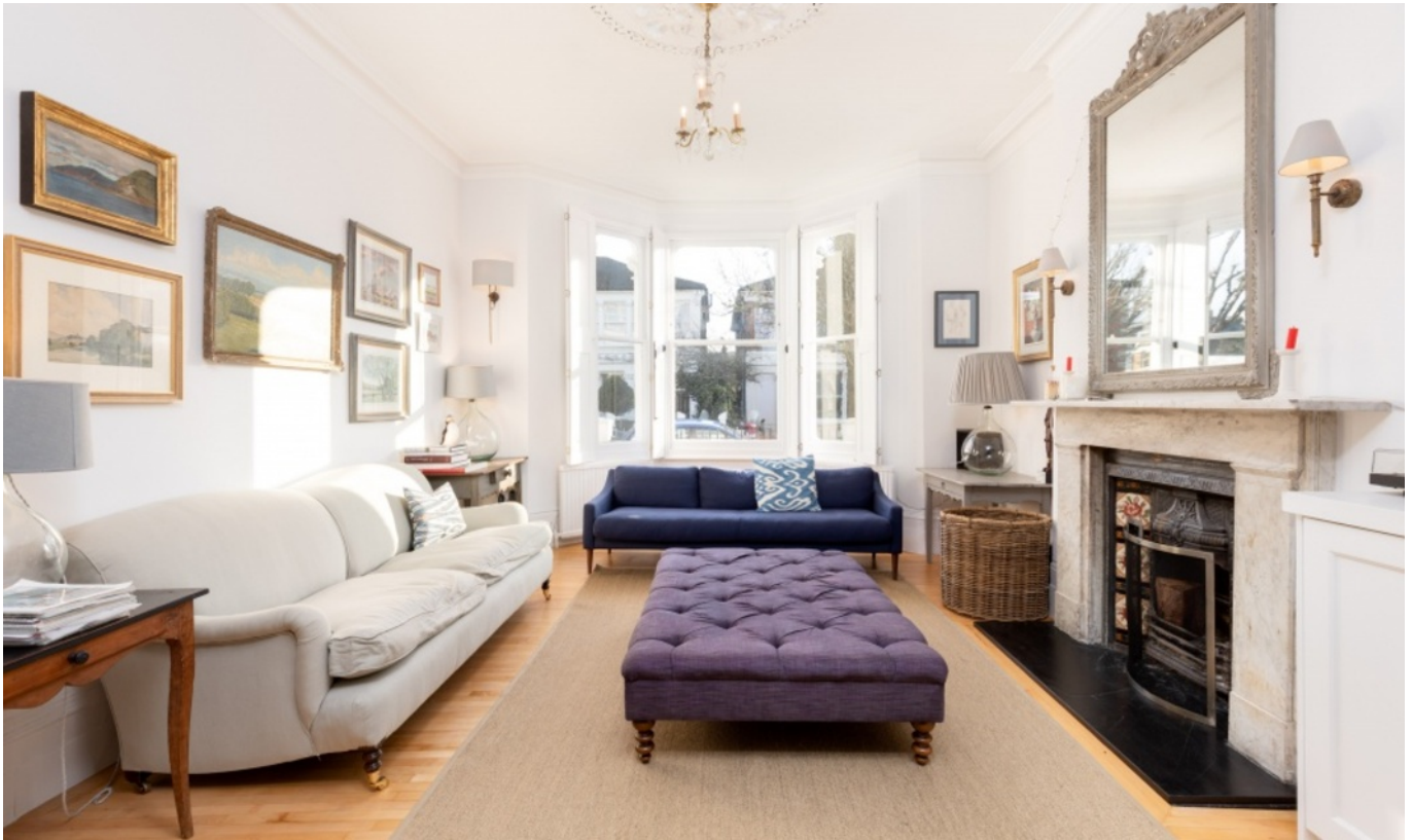
BASSEIN PARK ROAD W12 • WENDELL PARK GUIDE PRICE £2,500,000 FREEHOLD