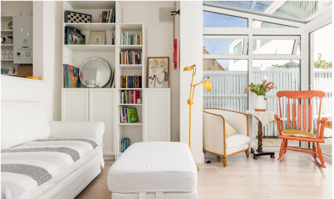
VALETTA ROAD W3 • WENDELL PARK £575,000 SHARE OF FREEHOLD