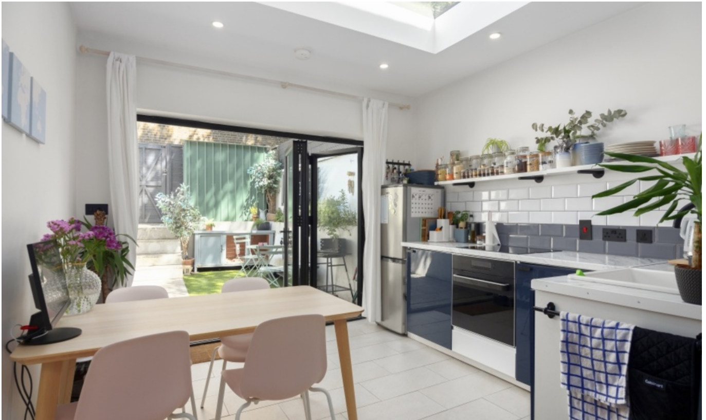
OLD FORGE MEWS W12 • SHEPHERD'S BUSH £375,000 SHARE OF FREEHOLD