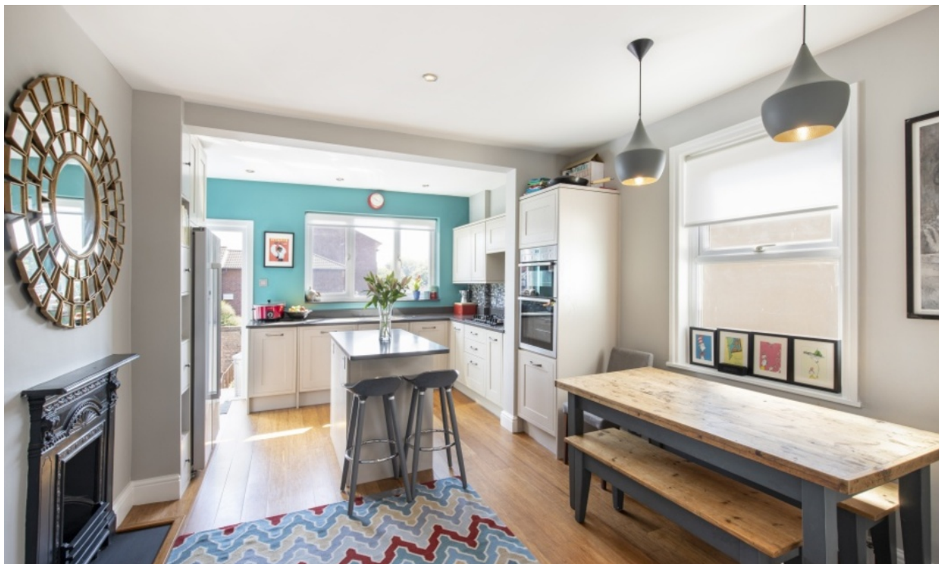
LARDEN ROAD W3 • ASKEW ROAD AREA £695,000 LEASEHOLD