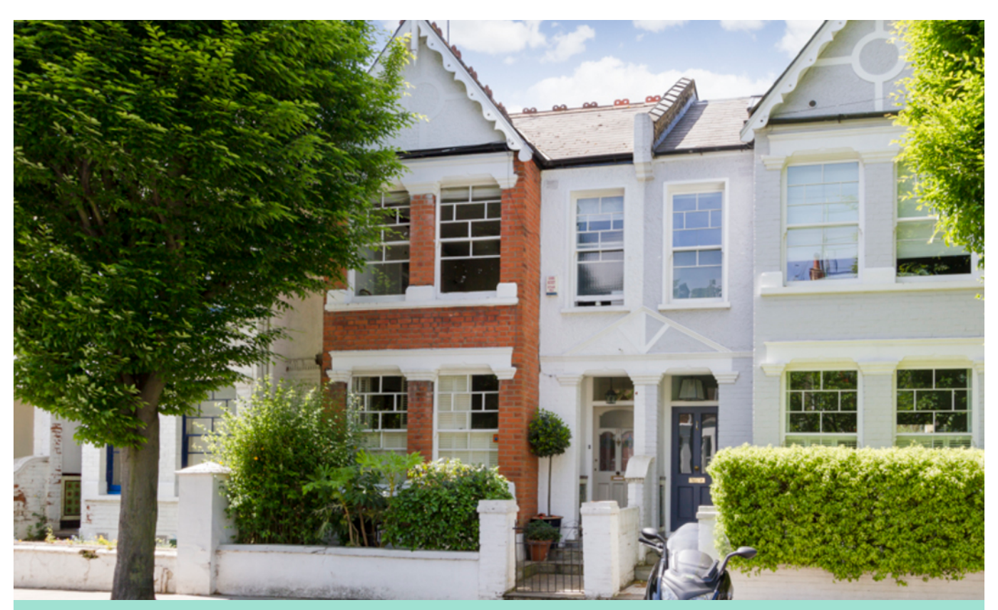
ST ELMO ROAD W12 • ASKEW ROAD AREA £1,100,000 FREEHOLD