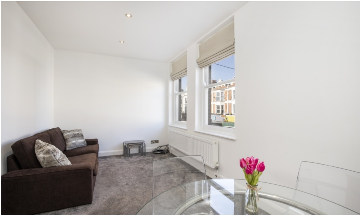
ASKEW ROAD W12 • ASKEW ROAD AREA £325 PW / £1408 PCM