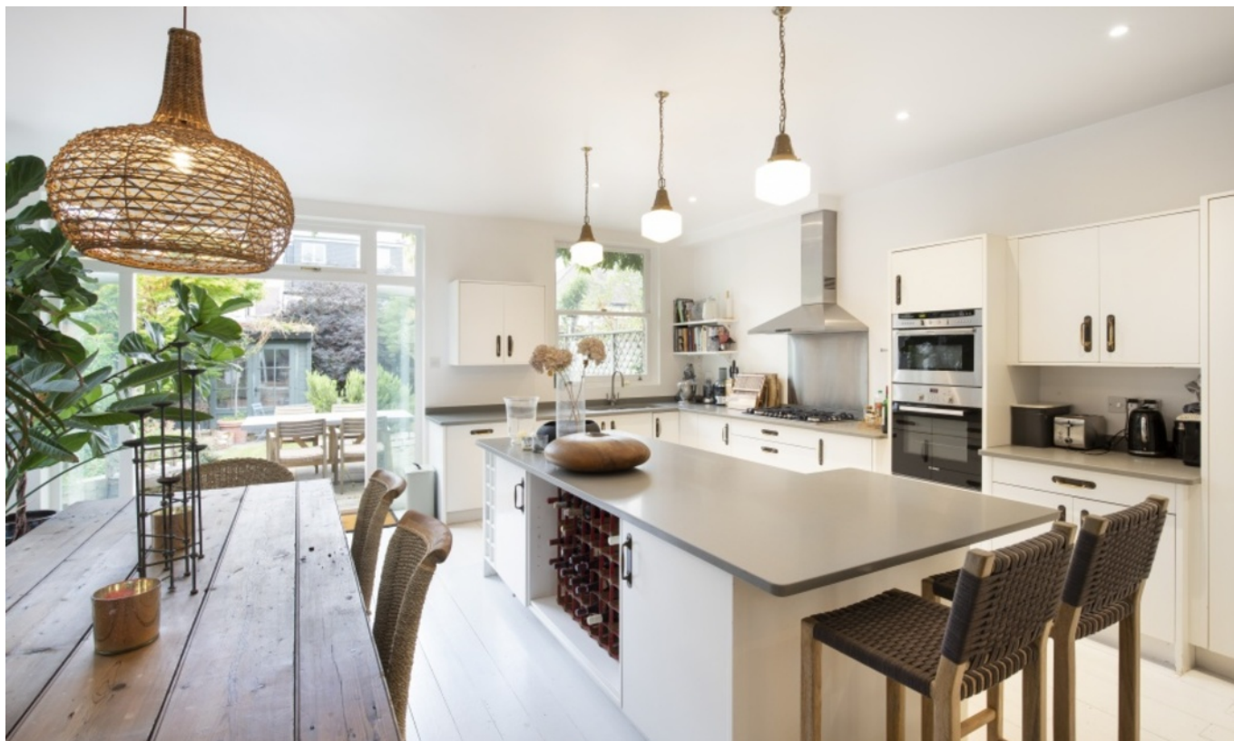
FIRST AVENUE W3 • ASKEW ROAD AREA £1,350,000 FREEHOLD