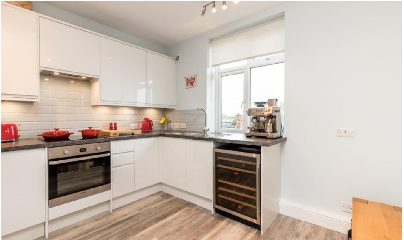
KELMSCOTT GARDENS W12 • ASKEW ROAD AREA £450 PW / £1950 PCM