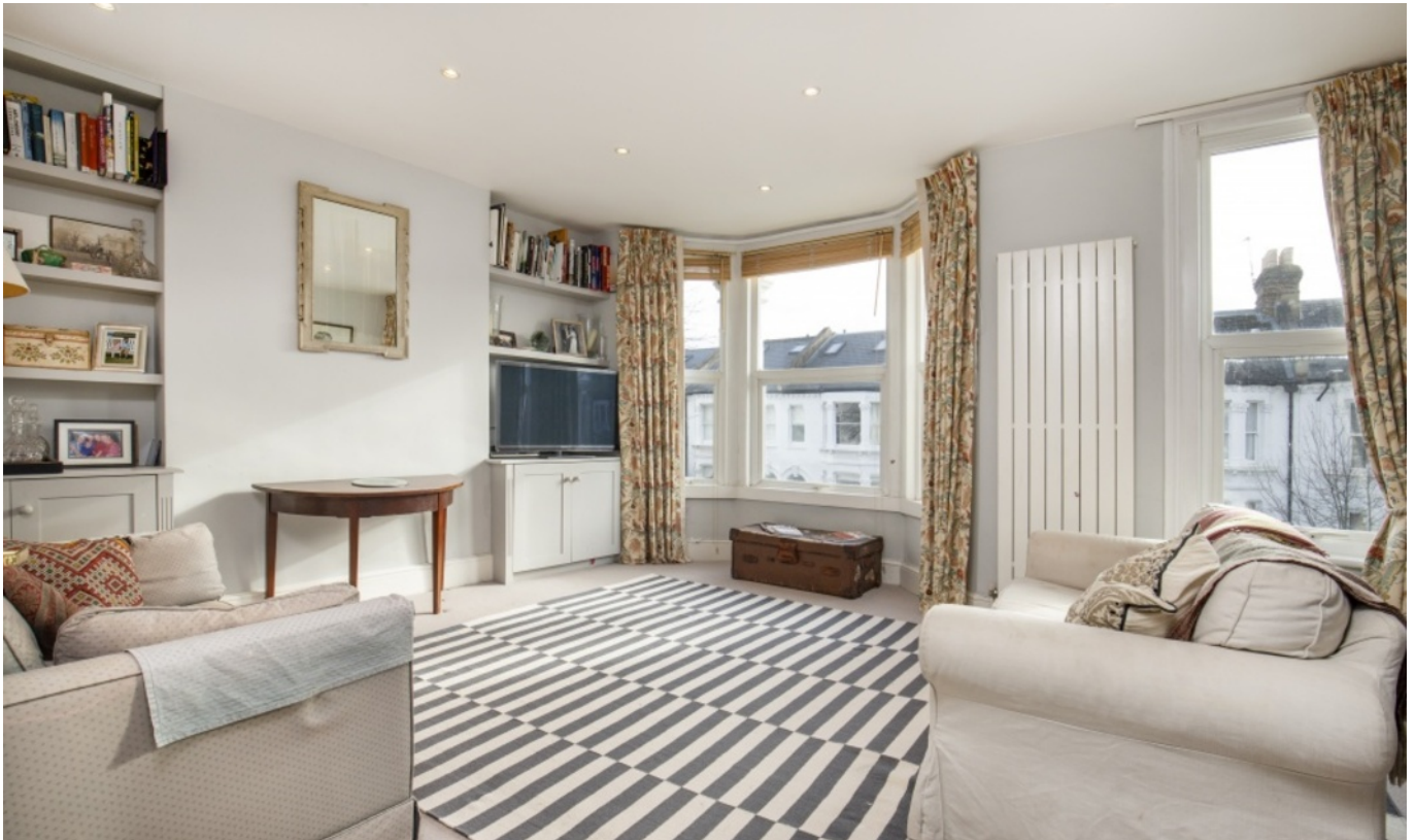
KEITH GROVE W12 • ASKEW ROAD AREA £500 PW / £2166 PCM