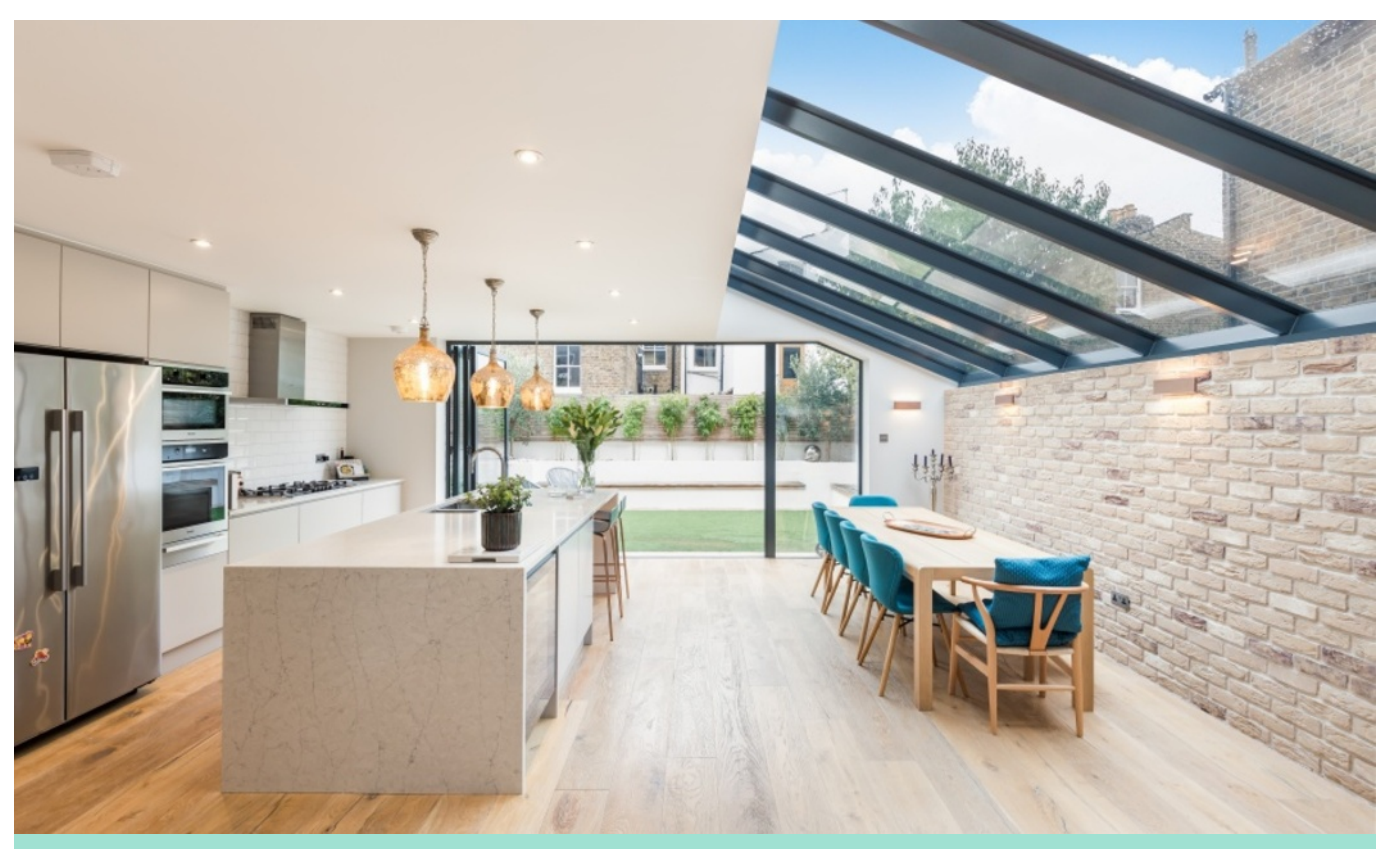
ROXWELL ROAD W12 • ASKEW ROAD AREA £1,785,000 FREEHOLD