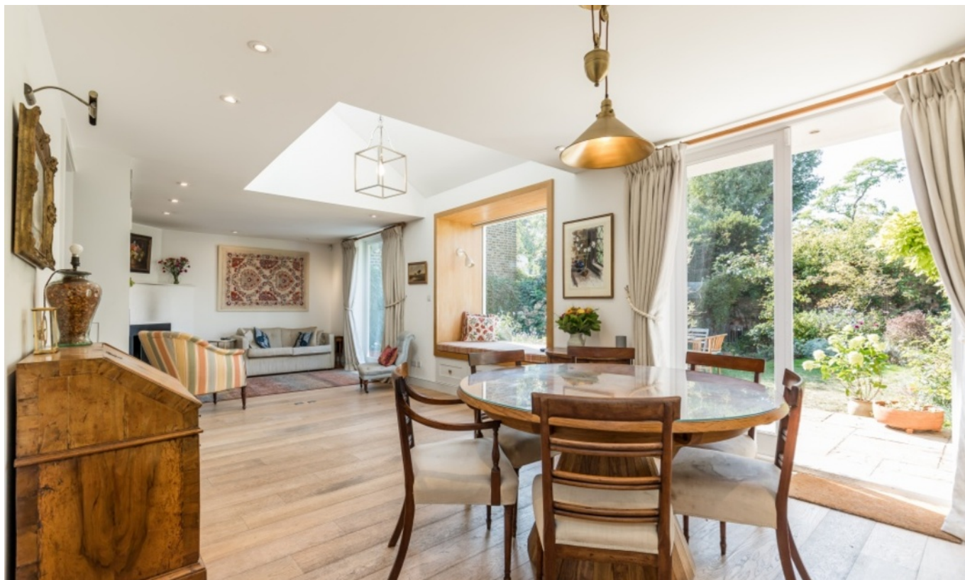
RYLETT CRESCENT W12 • WENDELL PARK £1,350,000 FREEHOLD