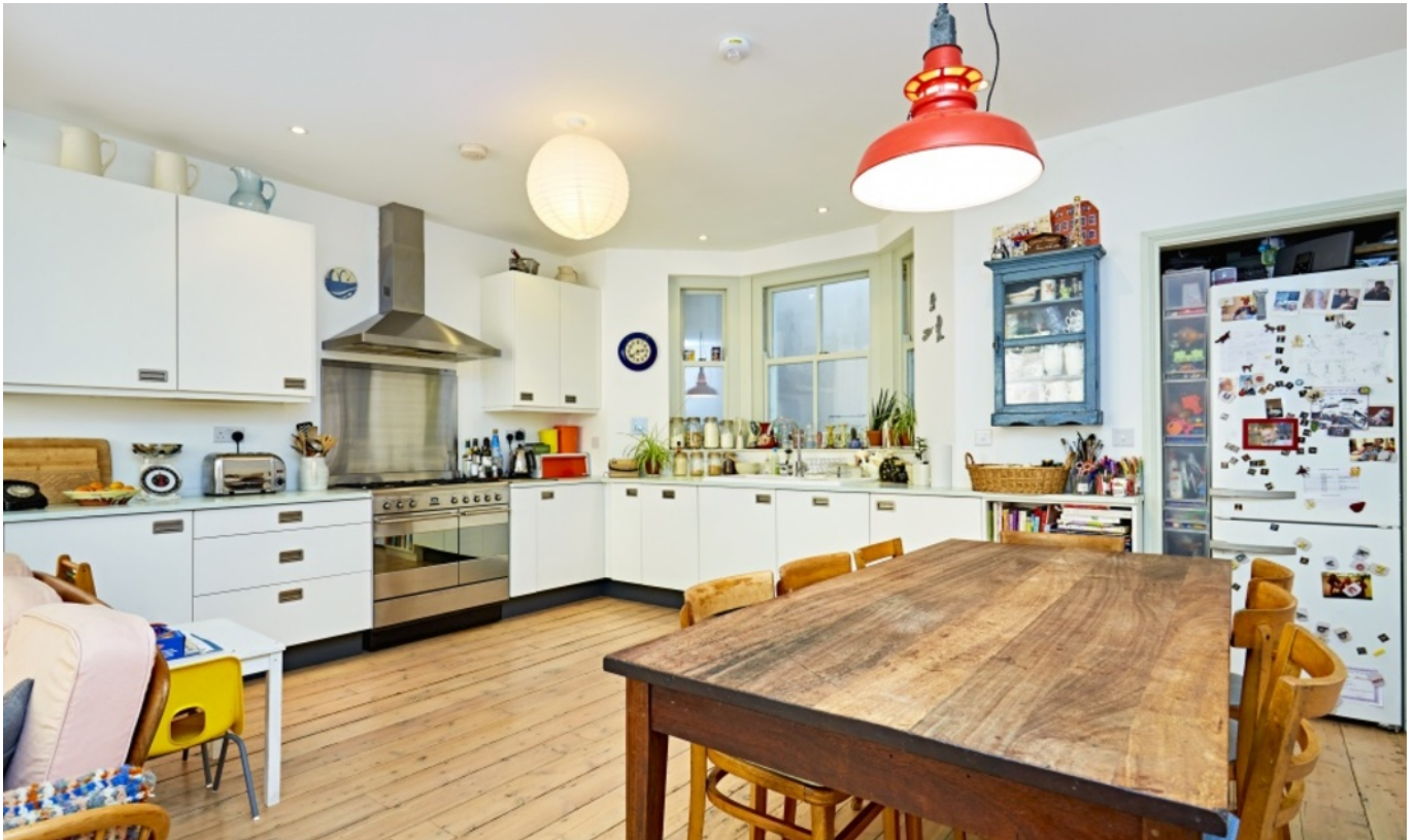
SOUTHERTON ROAD W6 • BRACKENBURY VILLAGE £2,000,000 FREEHOLD