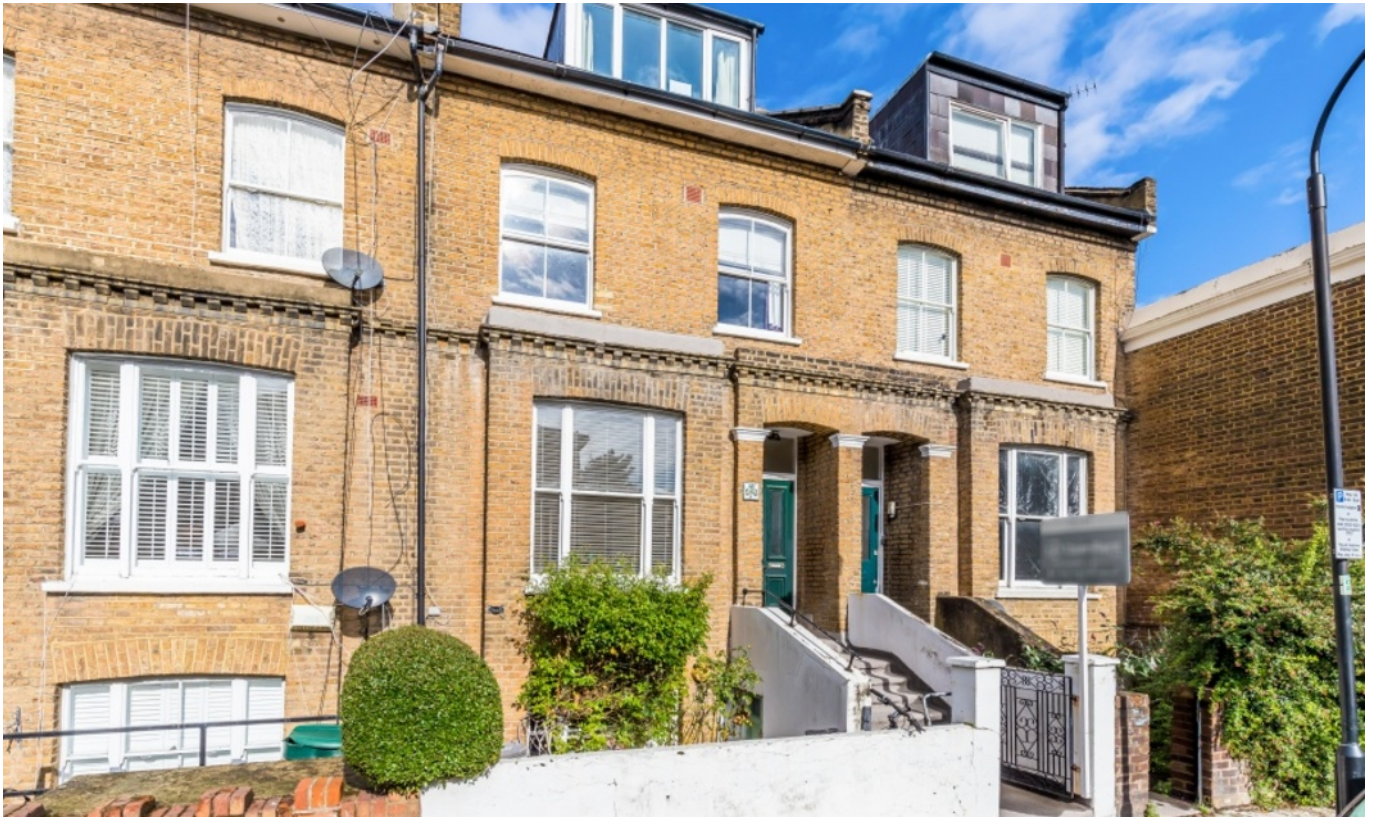
BASSEIN PARK ROAD W12 • ASKEW ROAD AREA £360,000 LEASEHOLD